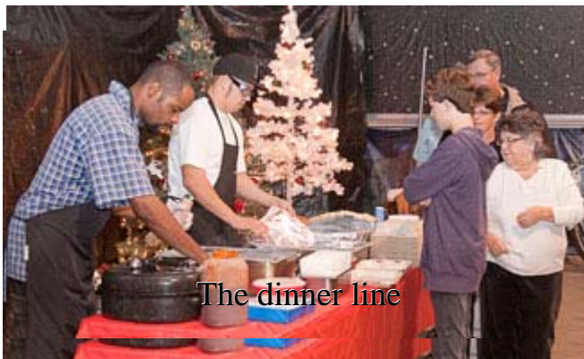
The dinner line