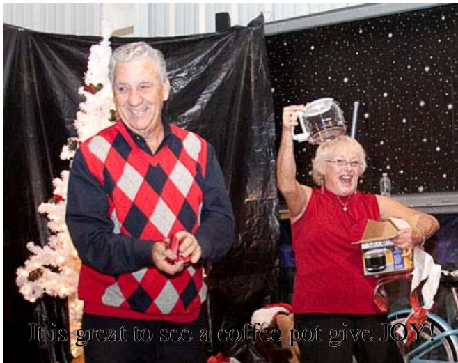
It is great to see a coffee pot give JOY!