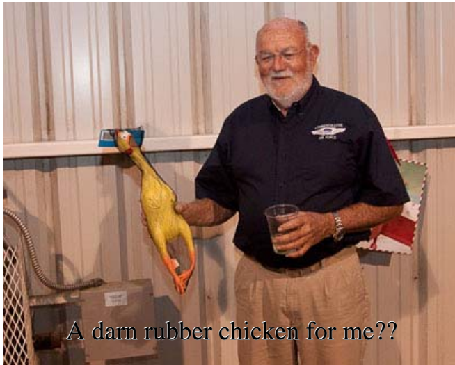
A darn rubber chicken for me??