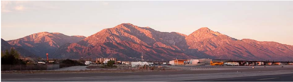
A Beautiful Day

This newsletter is published by and for the Friends of The 3rd Pursuit for their sole enjoyment and entertainment. It is not associated with the Commemorative Air Force and is strictly for the use of the Friends of The 3rd Pursuit