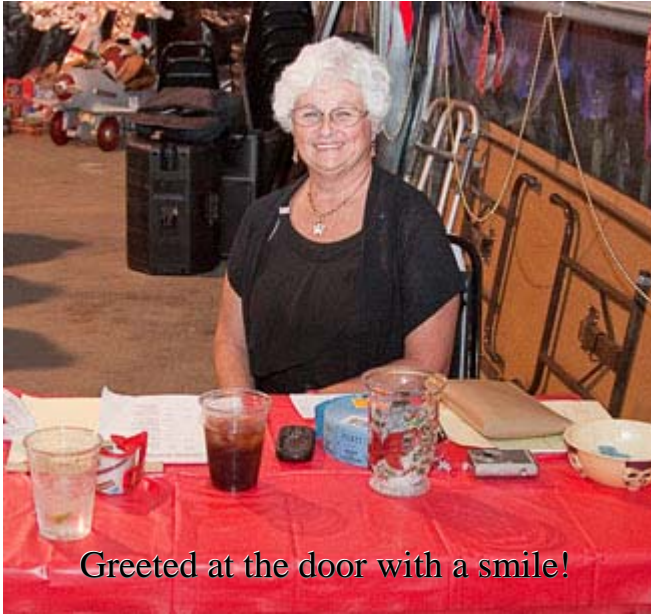
Greeted at the door with a smile!