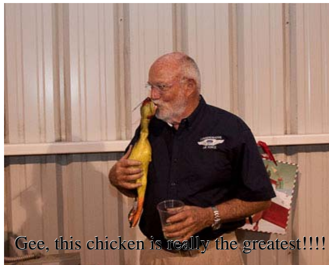
Gee, this chicken is really the greatest!!!!