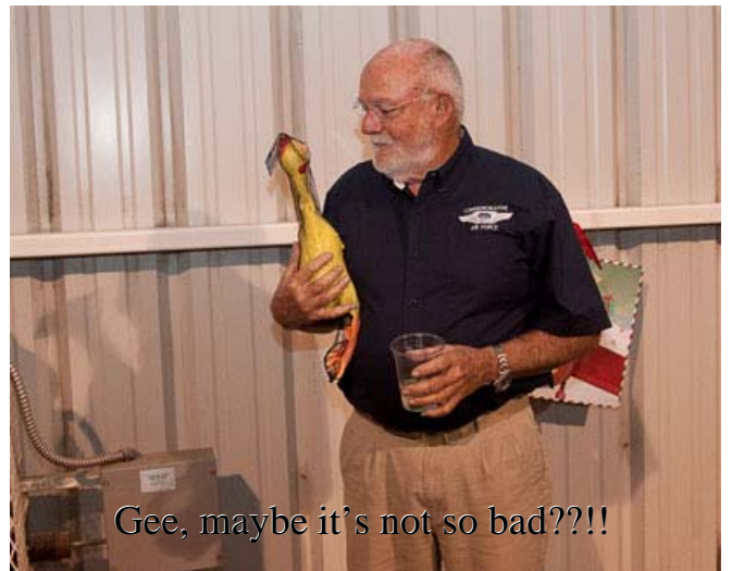
Gee, maybe it's not so bad??!!