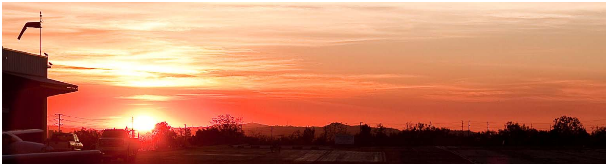
A Beautiful Sunset