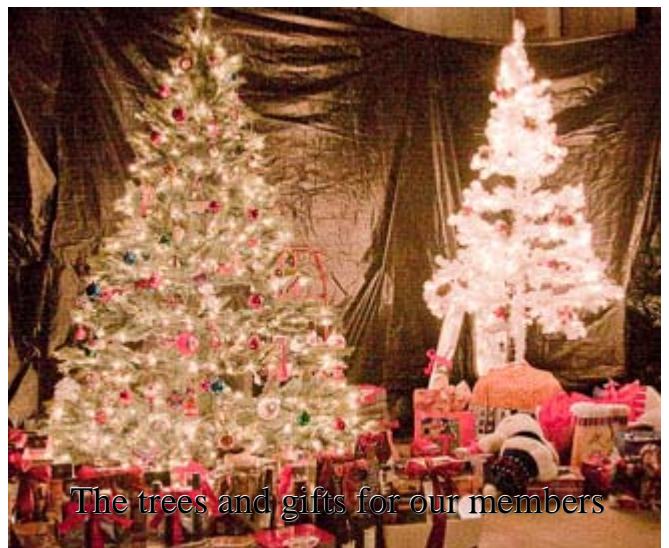
The trees and gifts for our members