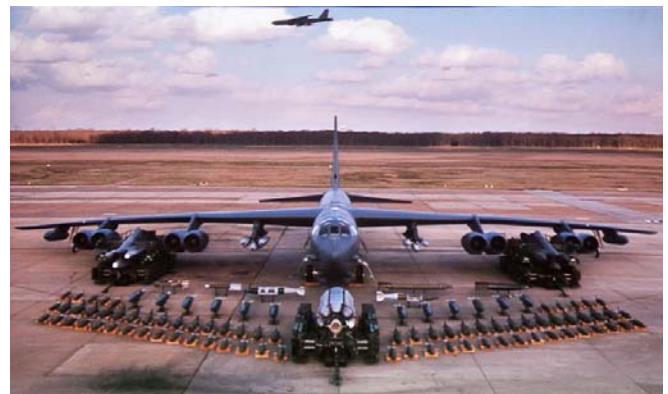
B-52 The 'Big Stick' of Freedom For 55 Years

there was a single midair collision. It took 150 man-hours of preparation for each hour of flight time to keep them flying. Their airfoil surfaces have many vortex generators. The B-52H model was upgraded to turbofan engines and can be recognized by the nacelle shape.