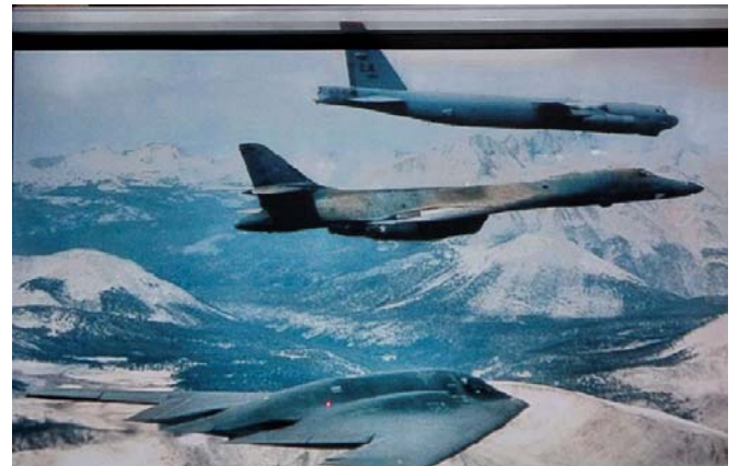
B-52 with the B-1 Lancer and the B-2 Spirit Bombers

That means that it will be 100 hundred years old when {or if} it finally retires!!!!