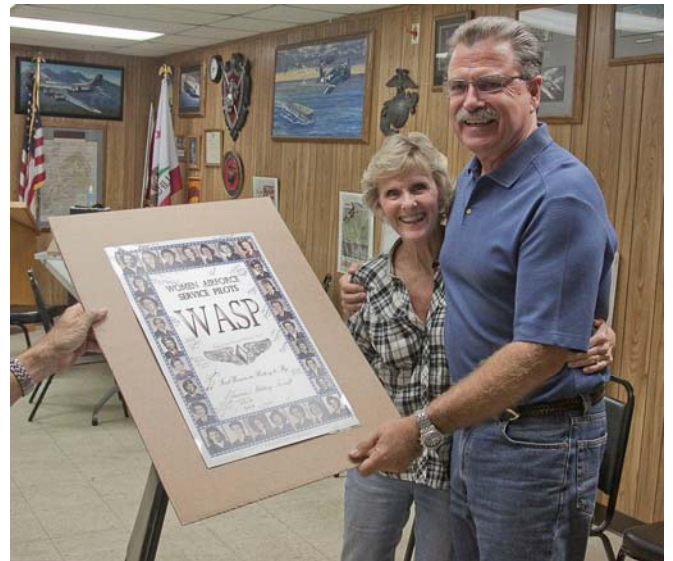
It caught the attention of many of our members