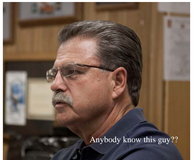
Anybody know this guy??