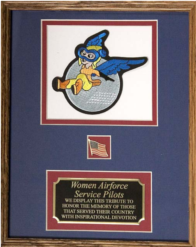
Bud's Plaque presented to the WASPS