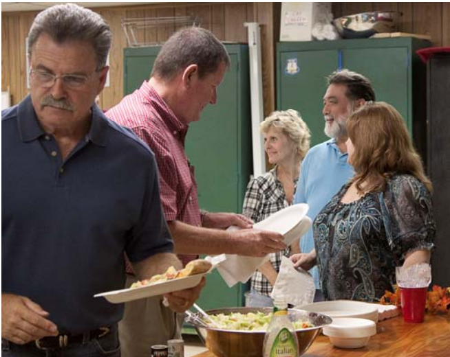
Two Dougs in a row! Food-Food-Food